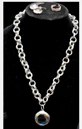
BEAUTIFUL CRAFTSMANSHIP IN QUARTER ONE ART METAL JEWELLERY - IMPRESSIVE WORK!