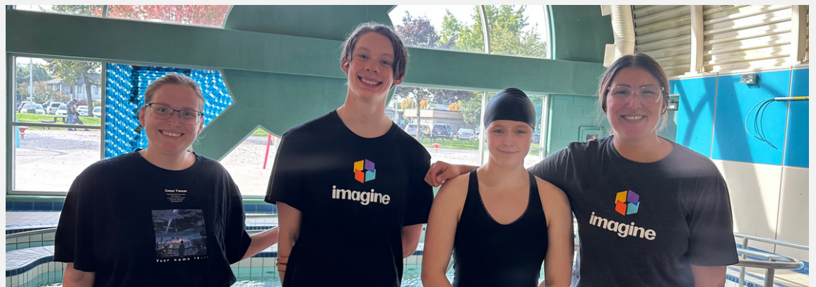
IMAGINE SWIMMERS REPRESENTING US WELL!